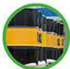
LUBE OIL & ASSOCIATED PRODUCTS

Speciality Chemical: In a short span of time Repono has gained trust of its customers for its competency in optimised supply chain for Specialty Chemicals. Storage of Specialty Chemicals is a distinct area of expertise the company has mastered in. Unlike logistics of non-hazardous products, Specialty Chemical logistics includes a number of dangerous elements. The products have flammable, corrosive and toxic materials that need to be handled with care. So, the safety of Specialty Chemical logistics should be given the highest level of importance.